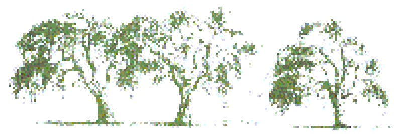
GREAT OAKS WATER COMPANY

P.O. Box 23490 San Jose, CA 95153 (408) 227-9540